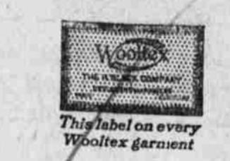
This label on every Wooltex garment

See that this label is on your spring garments.