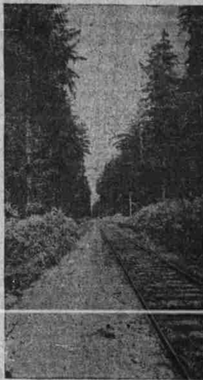
Miles of green lane embower the right of way of the Astoria & Columbia River railway from Portland to the sea coast. For 80 miles the train is in view of the Willamette and Columbia rivers, giving fine panorama of shipping.