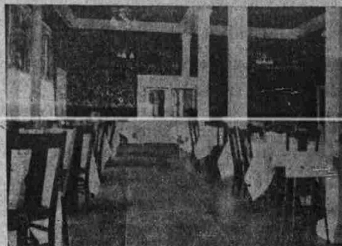
A corner in the large main dining room at Hotel Gearhart, where contest winners will dine.

Do you have the Right Kind of Help? Foley Kidney Pills furnish you the right kind of help to neutralize and remove the poisons that cause backache, headache, nervousness, and other kidney and bladder ailments. HILL'S drug store. At 4 11-18 25.