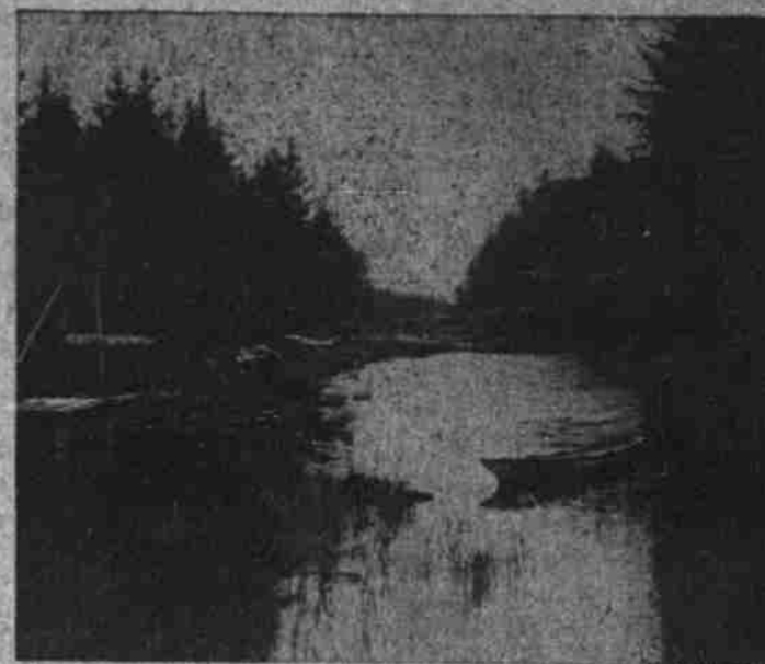
Inland waterways make safe boating at Gearhart Park, "By-the-Sea."