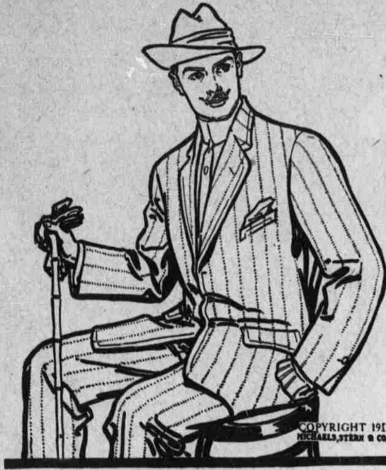
COPYRIGHT 1911 MICHAEL STERN & CO.