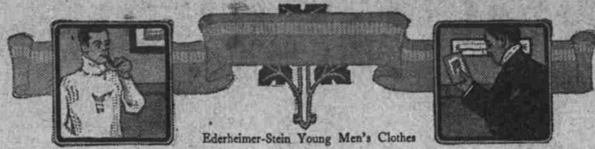
Ederheimer-Stein Young Men's Clothes

In New York there is a man who committed murder and he could have offered the unwritten law in his de-