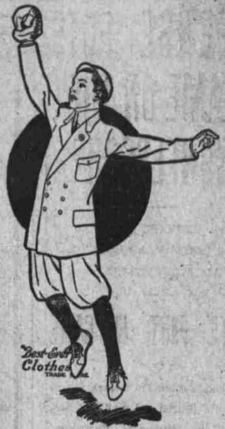
THE "BEST-EVER" BOYS SUIT "LOOK AT THE FEATURES"

set off the suit and fifteen features to offset the wear... Better investigate at once.