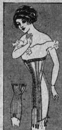
You Must Try on a Gossard Corset to Realize Why It Excels.

The Gossard Corset shown here is model O and is for the woman of full proportions. It makes a solid figure appear slender and graceful. The bust fits close, without raising the bust when seated, $8.50. Other models $3.50 and $5.00.