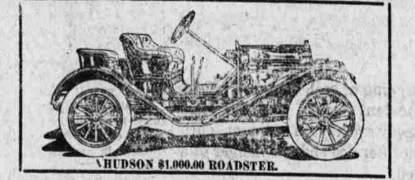
HUDSON $1,000.00 ROADSTER.