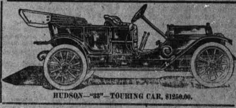
HUDSON "33" TOURING CAR, $1250.00.