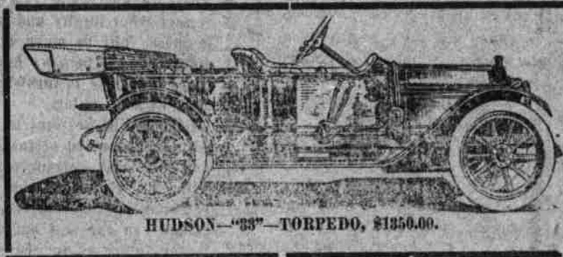
HUDSON "33" TORPEDO, $1350.00.