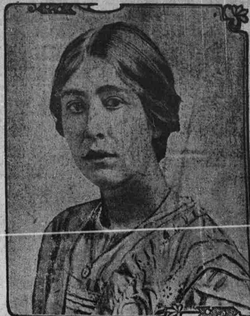
Miss Sylvia Pankhurst, Suffragette Militant Who is Completing Her Tour of the United States in Behalf of Votes. One of the Features in Connection with Her Tour is That Lady Bill Posters Almost Invariably of the United States in Behalf of Votes. She is the Lady Who Frequently Has Been Jailed for Her Activities in England.