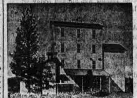
The Elgin Flouring Mills.

Remember the name—Doan's—and take no other. Jan 30 Feb 1, 3