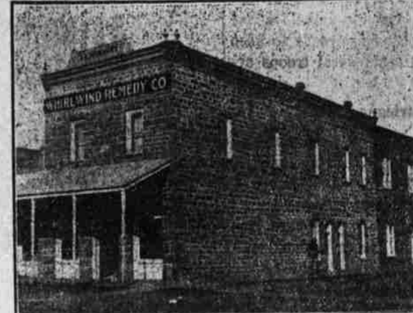
One of the Good Business Houses of Elgin.

Take Foley's Honey and Tar. It gives quick relief and expels the cold from your system. It contains no opiates, is safe and sure—Hills Durg store.