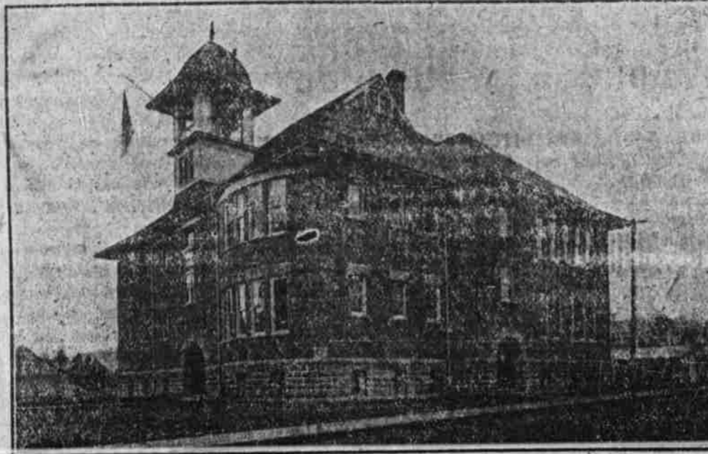
Elgin's Modern and Up-to-date School

trusted to another and in each instance he made good. After running a newspaper in Union for many years he retired and bought a dairy ranch near Elgin. Lately his health has failed him but to this day the old man is consulted on many matters of im-