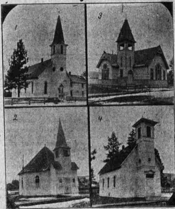
Four of Elgin's Houses of Worship.

will not be very long but those who observe closely can see the great tide coming and they are preparing for it.