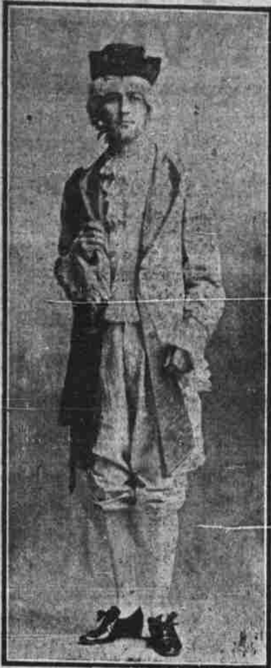
SIR JOS. PORTER, K. C. B.