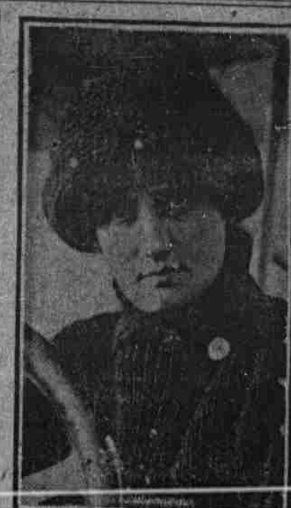
Baroness de la Roche, the only professional female aviator. She has recently recovered from serious injuries sustained in a fall from her aeroplane and is expected to be heard from in proposed aviation meets in Europe.

A party of officials from the Union Pacific, carried by private car "015", passed through the city this morning, going east. The officials have been on a tour of inspection throughout Oregon.