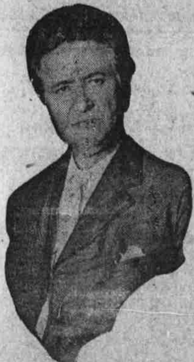
SENATOR LA FOLLETTE

Senator LaFollette as stirred up much talk on account of his refusal to meet the President at the President's solicitation to discuss the appointments of the Supreme Court. Through Secretary Norton, the President invited the Wisconsin senator, to call at the White House yesterday. It was intimated LaFollette sent him a note saying that he had only one suggestion to offer that being only men should be selected who would be certain to construe the constitution and the law with regard to the interests of the people and not those whose connections would bias their minds in favor of special interests.