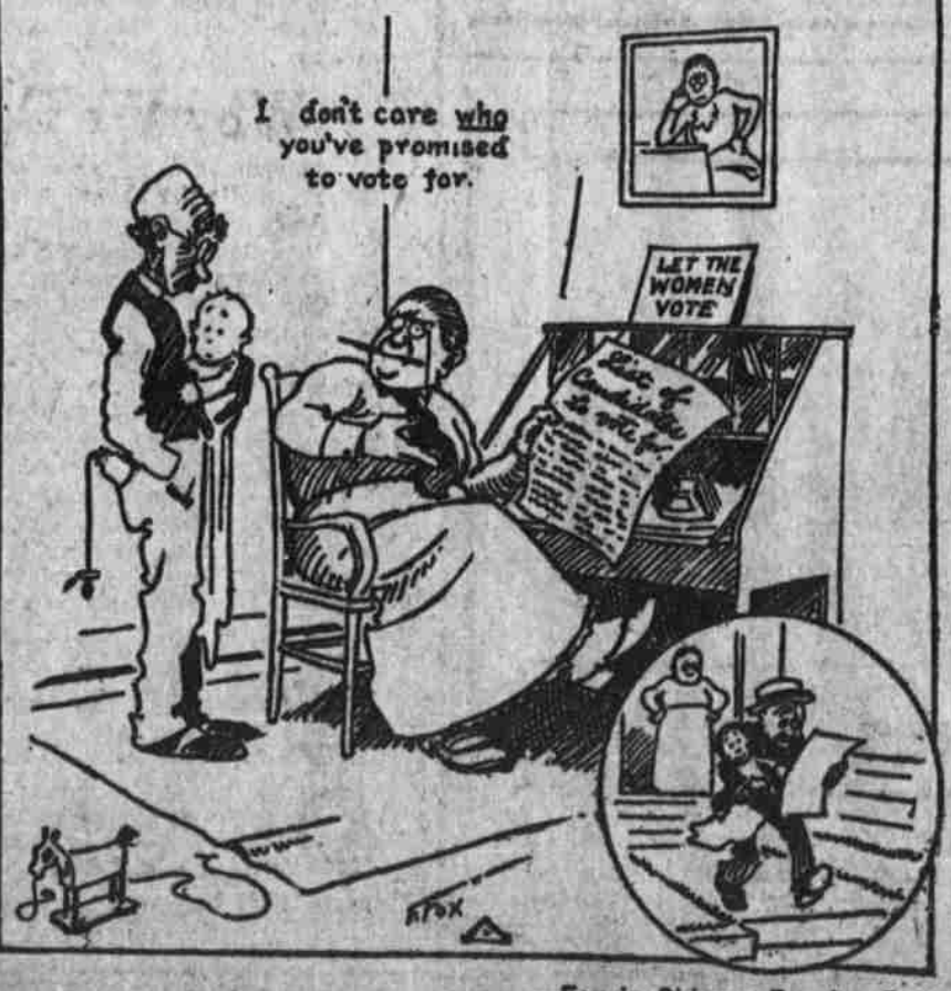
-Fox in Chicago Evening Post-

MODERN HEATING PLANT NOW IN WORKING ORDER.