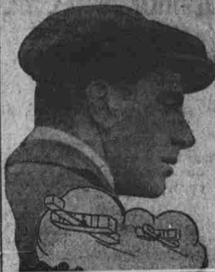
STON PHOTO NEWS

THREE OF THE WORLD-PAMER BIRDMEN COMING TO SAN PRAN-CISCO'S ACIATION MEET.