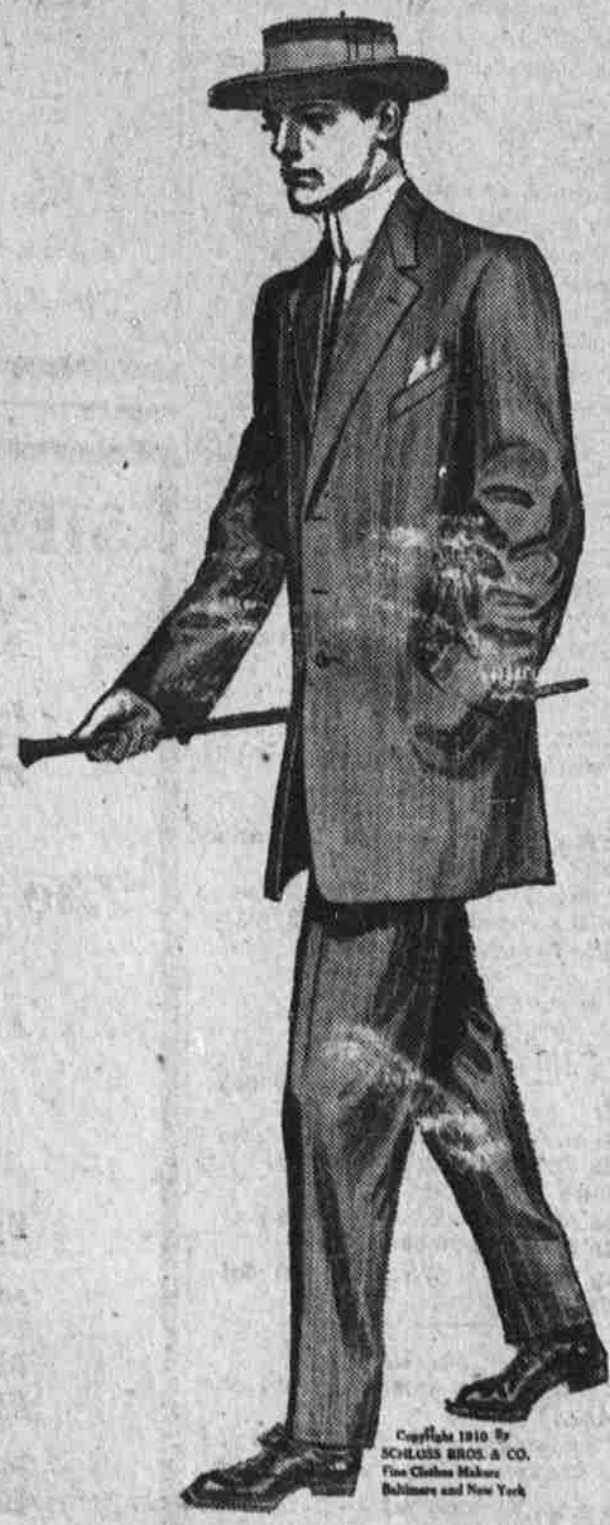
Copyright 1910 by SCHLUSSE BROS. & CO. Fine Clothes Makers Baltimore and New York