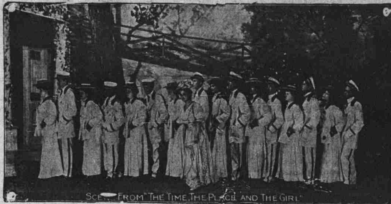
SCENE FROM "THE TIME, THE PLACE AND THE GIRL"

Alas, Too True. It's seldom is ever, You'll find them together, "The Time, the Place and the Girl."