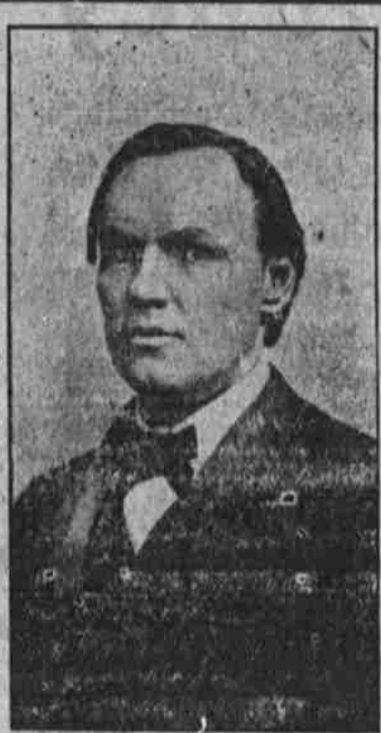
Clarence Darrow, Labor Lawyer of Chicago, Who Will Speak in La Grande Saturday Night.

No attorney is better known to laboring men of the United States than Mr. Darrow. His life has been devoted to the study of social and industrial condition of wage earners, particularly and the human family generally. Being a student and an authority on these questions in addition to being