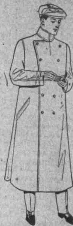
COPYRIGHT 1910 THE ROYAL TAILORS

We take your measure and guarantee satisfaction.