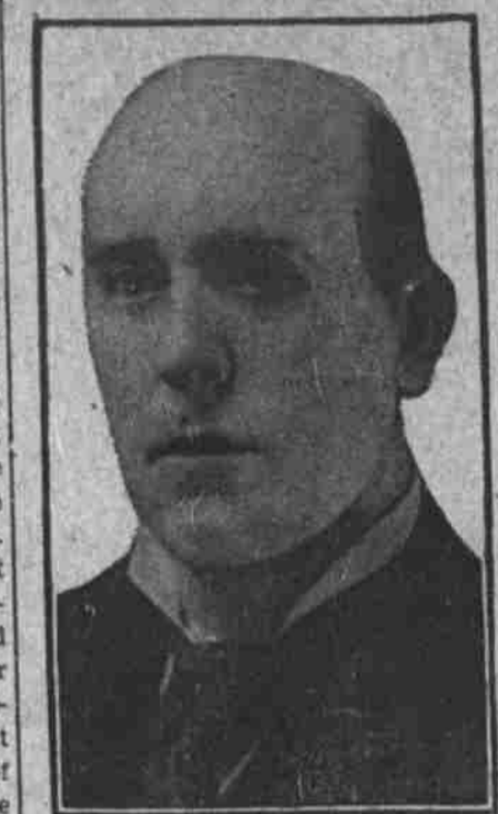
Ollie M. James, Democrat, representative in congress from the First Kentucky district, has played a large part in recent years in the politics of his state. He is serving his fourth term in congress.

Ollie M. James. Kentucky Congressman, High In Democrat's Councils.