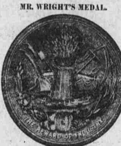
Reverse Side of the Wright Medal.

Crab apples are among the things that should be ordered now. The local dealers have them on hand and the growers are already peddling them around the city to some extent.