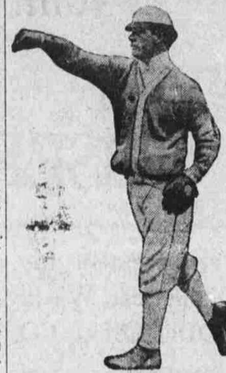
ED WALSH, CHICAGO AMERICANS' CRACK TWIRLER.

"You've got me there," he replied. "I haven't the slightest idea how I stand