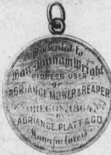
The Obverse Side of It.

agent for the company and president of the State Farmer's Union, yesterday.