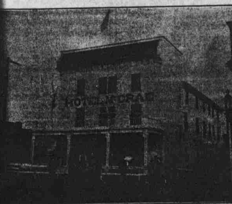
The McCrea Hotel First-Class in Every Particular.