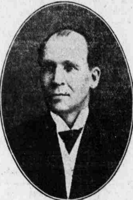
The Minneapolis orator and philosopher who appears at the Chautauqua twice tomorrow.