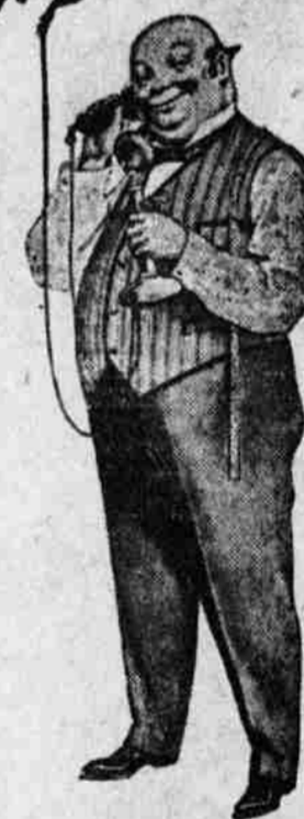
COPYRIGHT 1909, ED. V. PRICE CO.

Select your pattern today and have us take your measure.