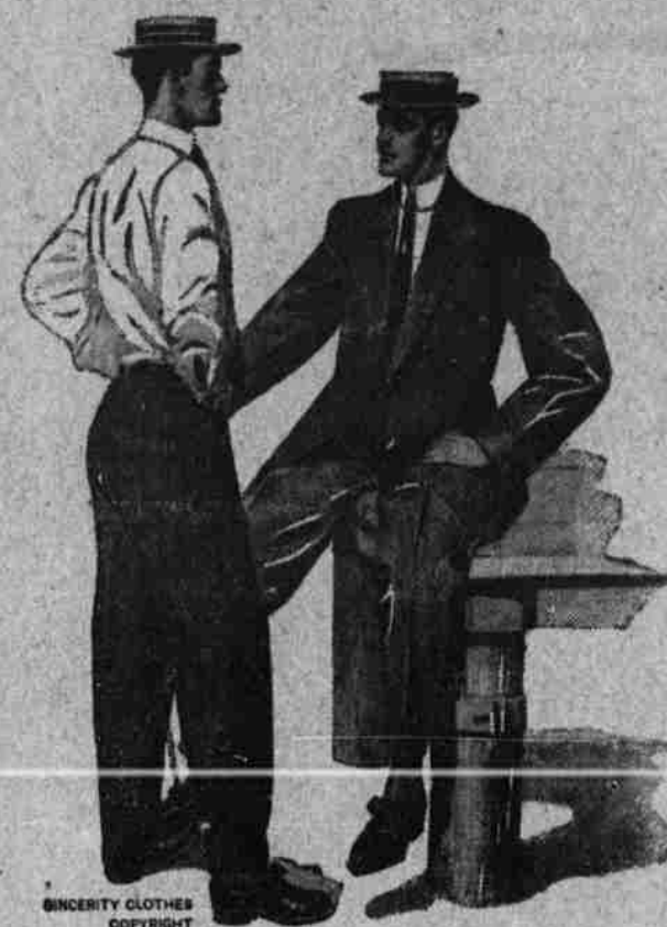
SINCERITY CLOTHES COPYRIGHT

We've everything you need for the Summer weather at the lowest possible prices.