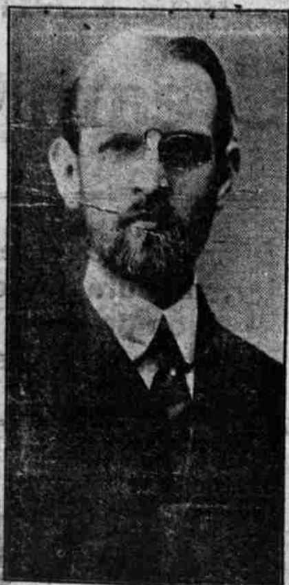
DR. SAMUEL B. CAPEN.

The movement has already begun with a three days' convention in Chicago, called to discuss ways and means