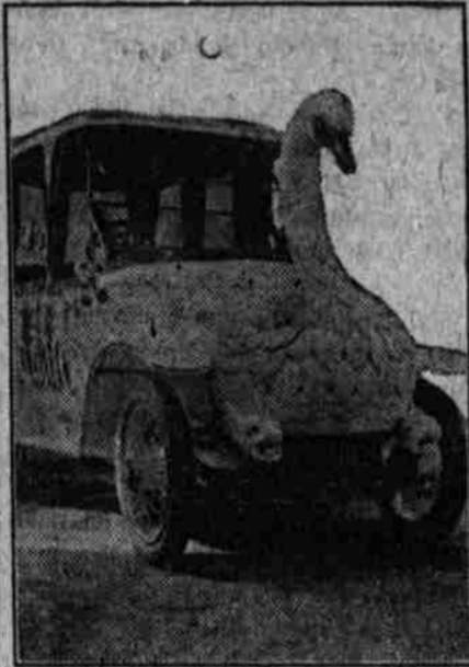
THE LATEST IN AUTOS.

A Car That Will Recall Painful Occasions to Certain Actors. Some automobilists say that the reason so many auto accidents have happened of late is because the public has become used to their warning signals and fail to keep as sharp a look-