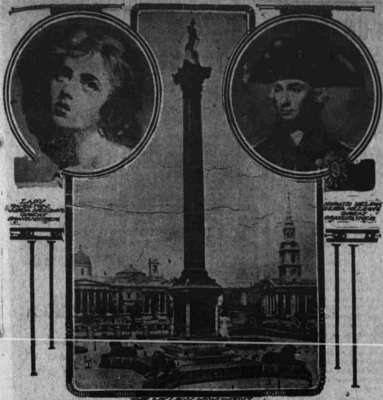
THE NELSON MONUMENT IN TRAFALGAR SQUARE, LONDON