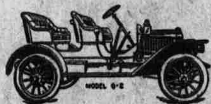
This beautiful 22 horse power machine with three spud transmission and detachable rear seat

We can deliver to you within 15 day either of these machines.