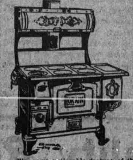
The most noticeable feature of the "Lorain" Steel Range is that it is mounted on legs.

YOU CAN BUY ONE PIECE OR ONE HUNDRED PIECES AT THE ABOVE PRICES. THESE ARE OUR OWN IMPORTATIONS FROM THE CELEBRATED ROSENTHAL FACTORY IN BAVARIA