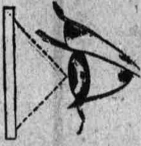
Old Style Flat Lens

Notice the difference between this deep curve lens and the opposite one. Wider range of vision, fits closer to the eye and looks better.