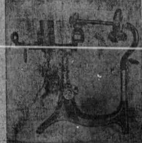
I have some of the finest optical instruments in the U.S. and thoroughly understand the use of them. The above cut is one of my machines

All my Glasses are Ground to fit the face as well as fit the eye as with my machinery I can grind them any shape to conform to your features