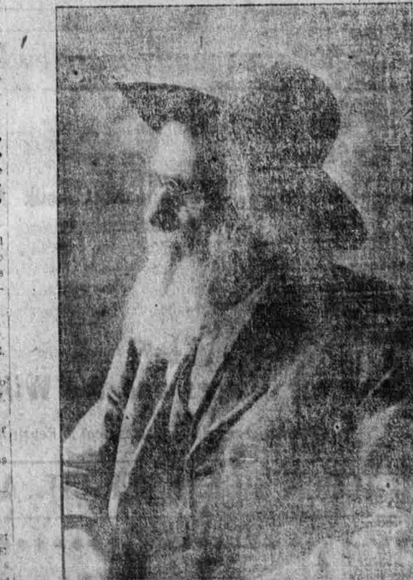
Ezra Meeker—he appears today.