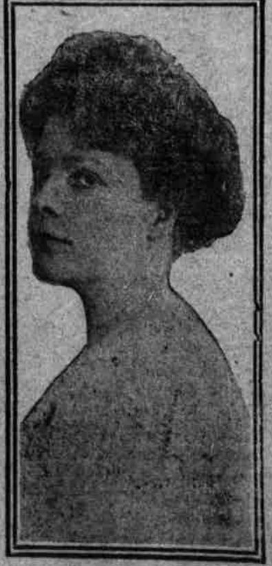
Leading lady with "The Lion and the House"