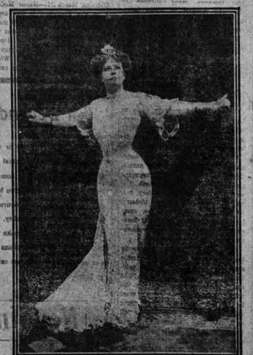
She Plays the Character of Shirley Rosemore (The House) in the "Lion and the Mouse" Here next week.