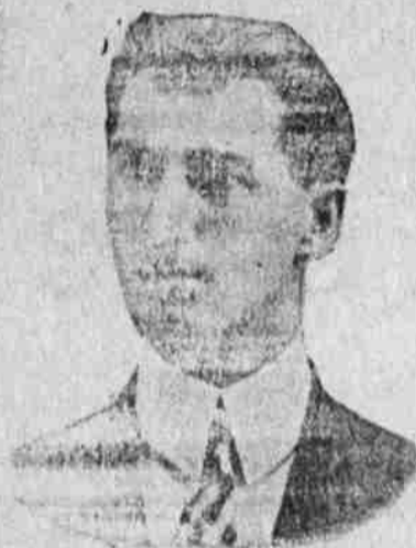
Is now at HOTEL SOMMER