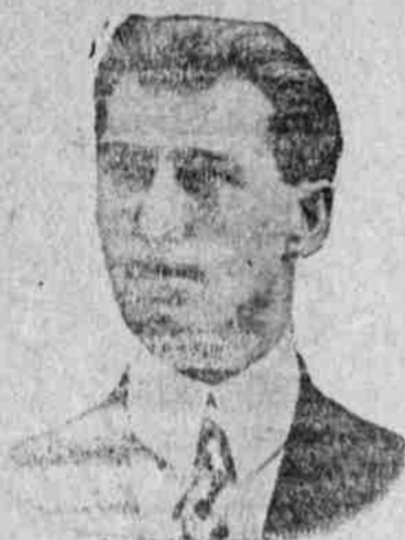
Is now at HOTEL SOMMER