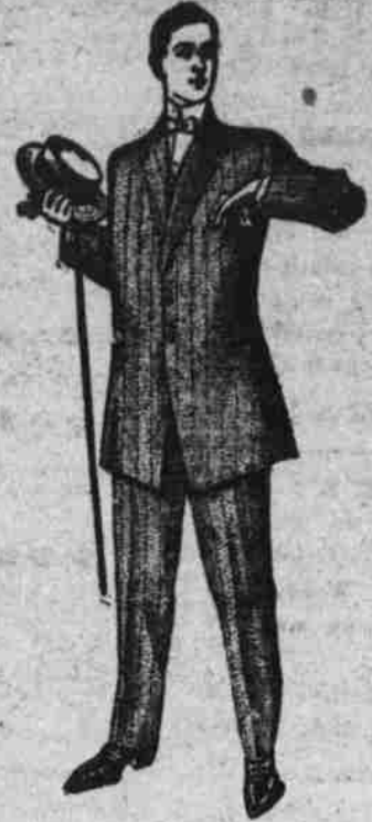
Fashion 644 Three-Button Novelty Sack, slanting lower pockets

Nowhere else in the community will you see such an elegant assortment of fabrics, or such complete value for the money. Let us take your measure and prove our claims. Today.