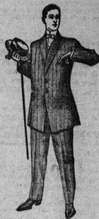
Fashion 644 Three-Button Novelty Sack, slanting lower pockets

Exclusive local representative of Ed. V. Price & Co.