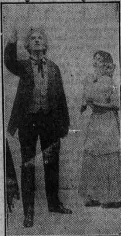
"The Climax" Scene at Steward Feb. 1

"The Climax" which comes to the Steward next Wednesday is a simple and pretty play that never fails to make an impression on even the most indifferent theatre-goer. It is particularly attractive to lovers of music as the heroine is a girl, who has a wonderful voice and has the promise