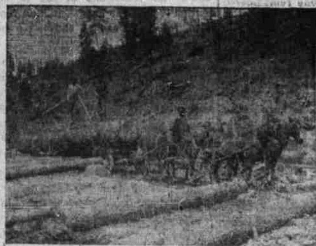
How Logs are Handled