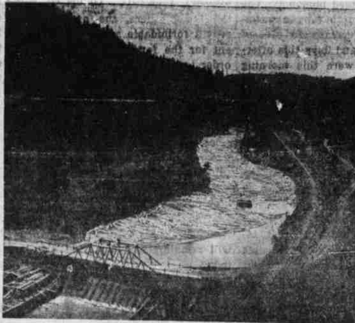
One of the "Drives" on the Grande Ronde.