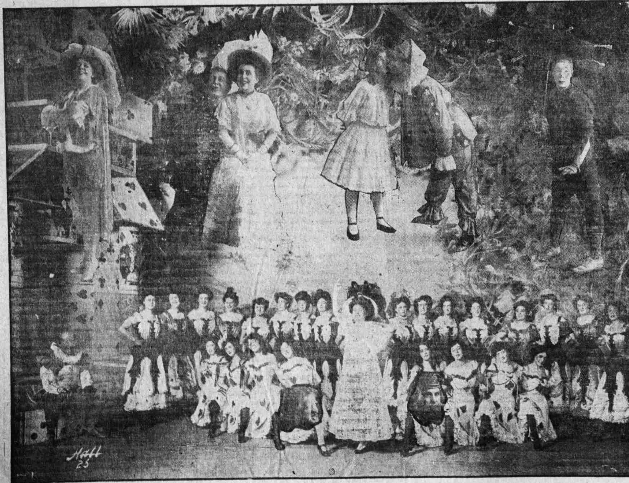
At The Steward Opera House January 15