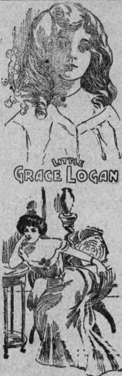
LITTLE GRACE LOGAN