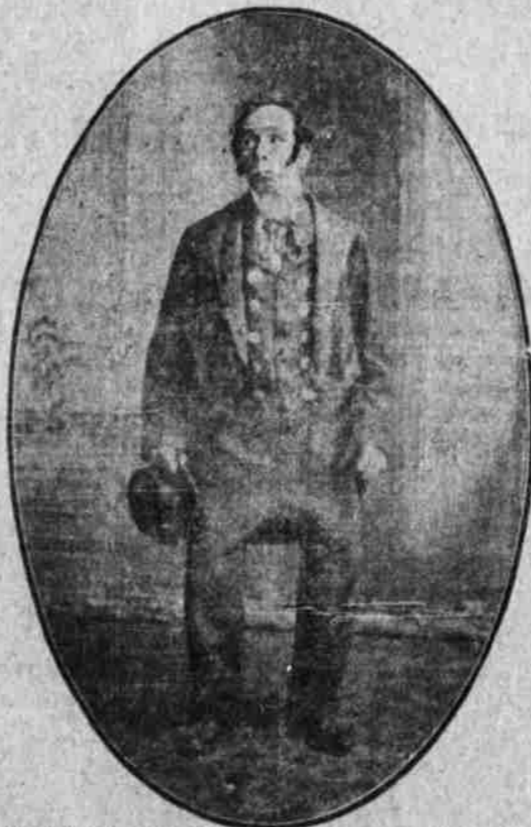
"UNCLE TOM" IN THE BURLESQUE RUNNING AT THE SCENIC.

Another Western Union Telegraph wire is to be constructed between Portland and Huntington to do local work. At present there are seven wires between Huntington and Portland, two of which belong to the G. R. & N. The other five can seldom handle