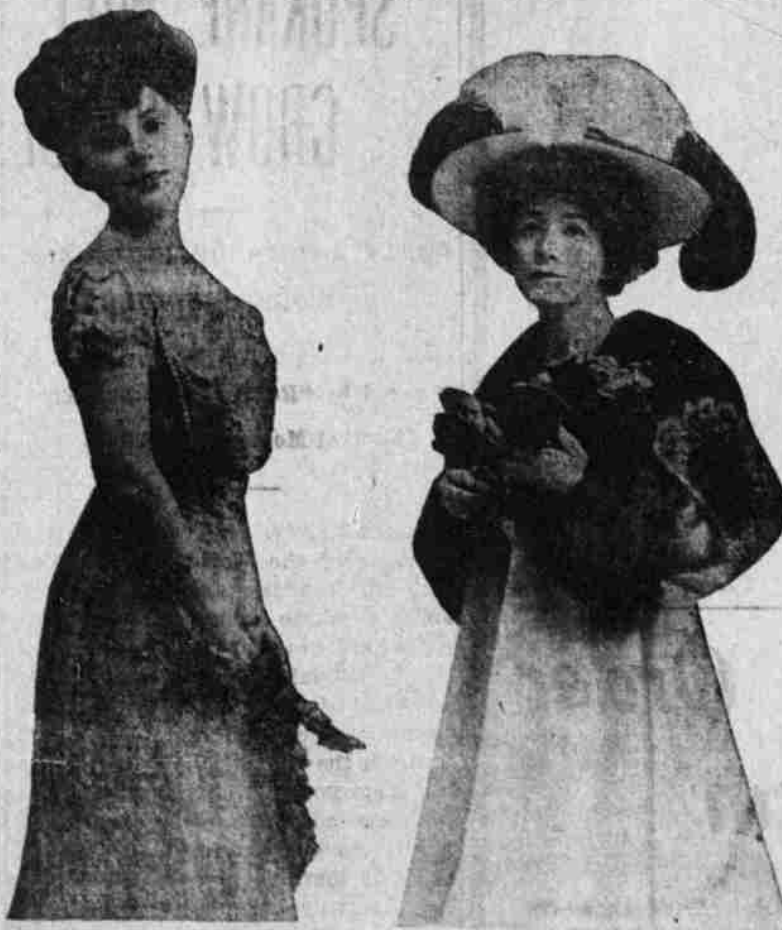
TWO OF THE BEAUTIES IN "THE SPOILERS."