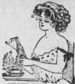
SILVER TOILET SETS.

Nothing will be as much appreciated by the bride and groom as something that will be of practical as well as decorative use—in other words, silver backed hair brushes, combs, manicure sets, etc. etc.