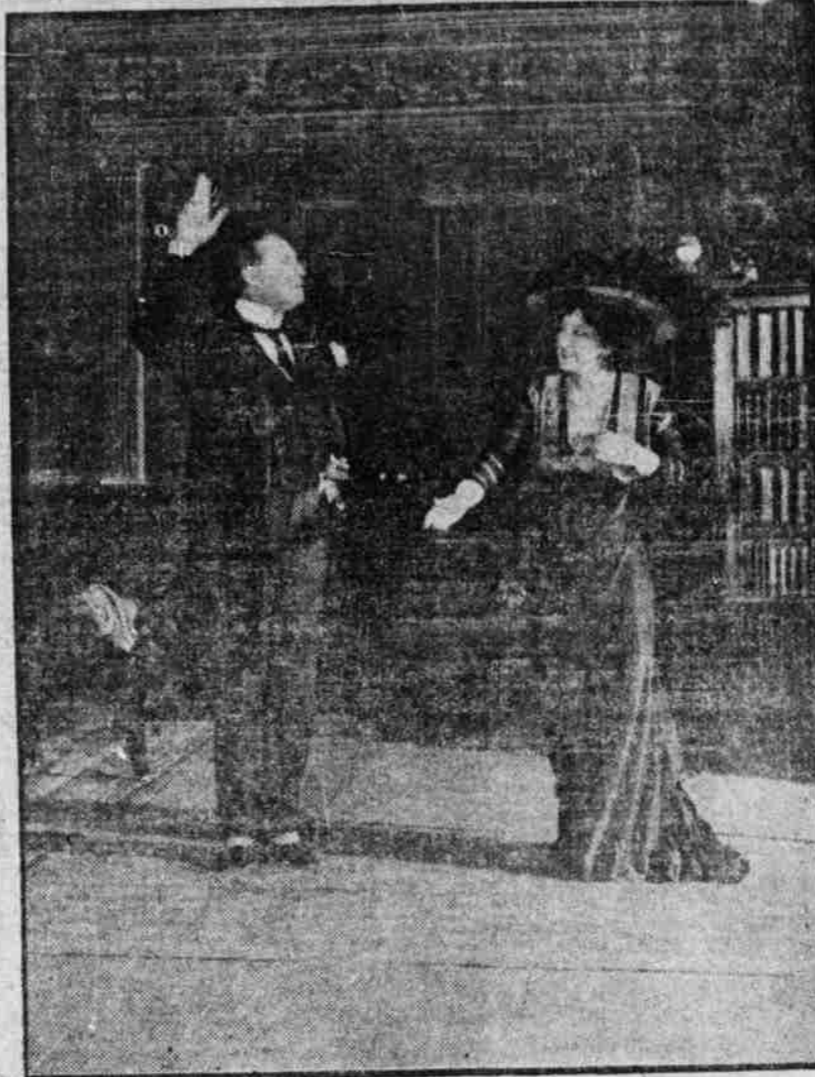
Scene in "The House of Bondage" at the Steward Friday Night.