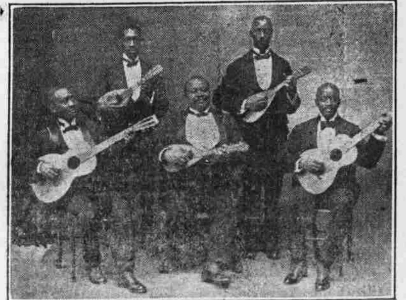
The Dixie Quintet, Coming to the Steward February 4, is Classed as the Best of its Kind on the Road.