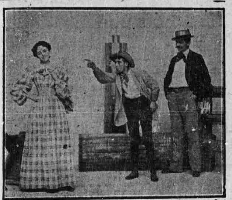
SCENE FROM "SHORE ACRES."