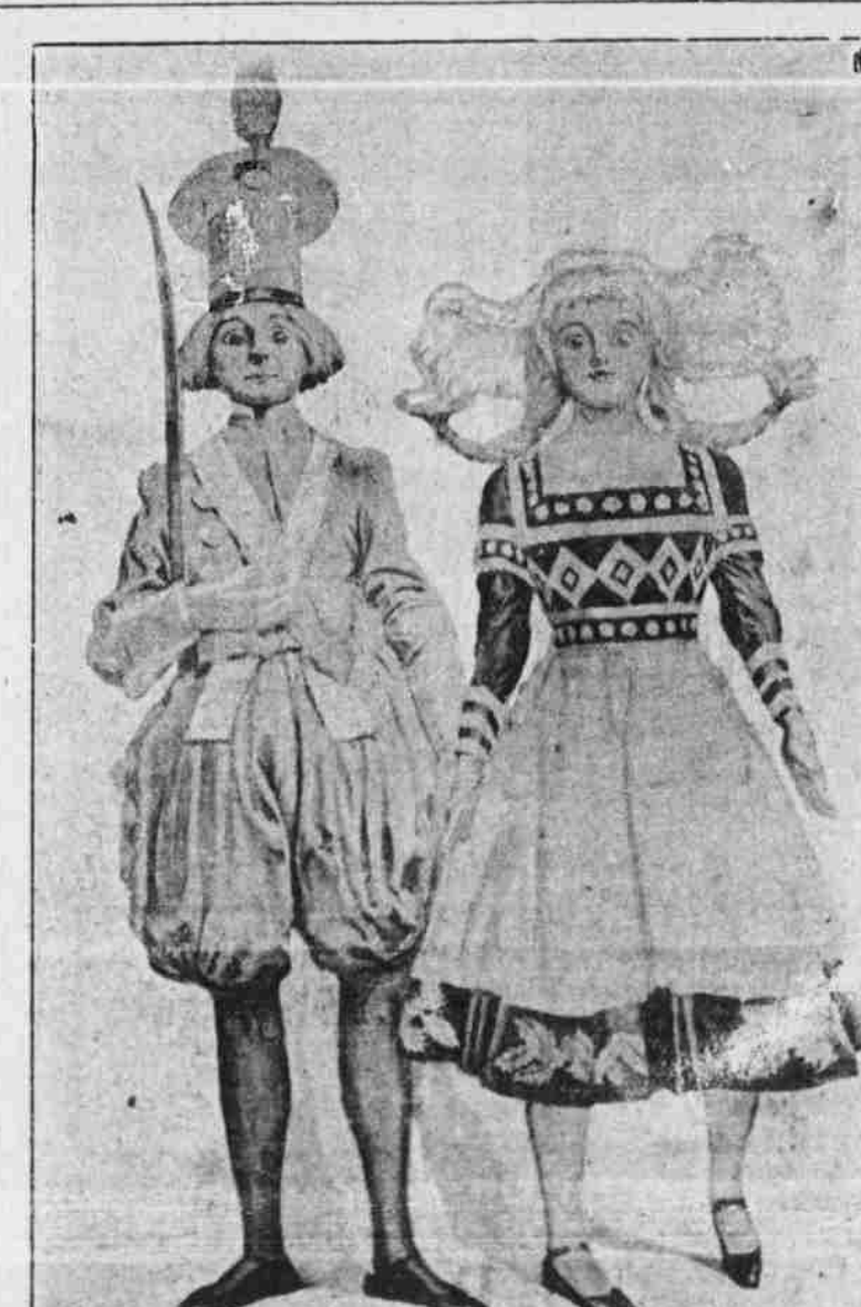
"ALAN AND JANE," IN "BABES IN TOYLAND."