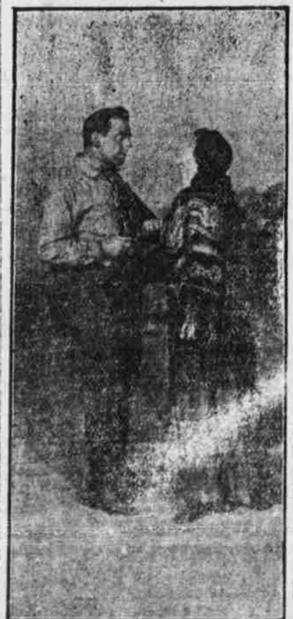
Scene from "The Great Divide."