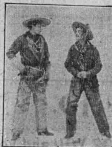
Scene from "Texas."

house Saturday, matinee and evening, November 21. It is declared a charming play of western life, unusually picturesque and as romantic as any costume play ever presented. It tells of the love and trials of the people of the plains in a captivating and realistic manner. The play is at times exciting as western life is apt to be with its cowboys, Mexicans and "gun-men" but it also has its moments of happiness, when all is laughter, sunshine and joy.