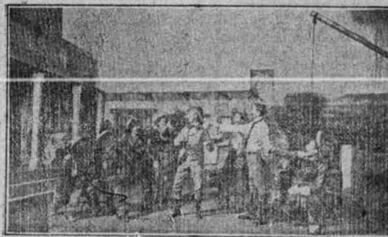
Scene from Act I, of "Texas."

Tramp Made Them Talk. A municipal judge in Chicago recently heard an unusual case. A wife had her husband arrested for silence, testifying that he had not spoken a word to her for three months. After listening to the testimony of both sides, the judge ordered the husband to converse with his better half on some subject or other. "If you don't obey," he added, "I'll give you a good